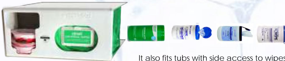
It also fits tubs with side access to wipes