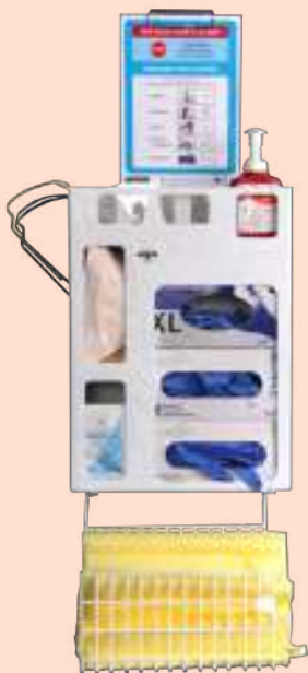
"Easily hooked on and off"