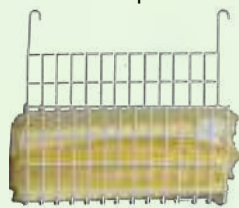
"Hook-On" Basket (for Full Gowns)