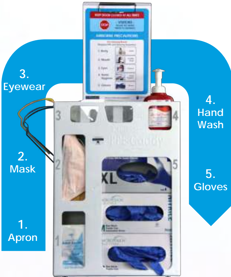
Where a full gown is required a wire basket can be clipped on to the bottom of the caddy

Easy step by step instructions help visitors and staff comply