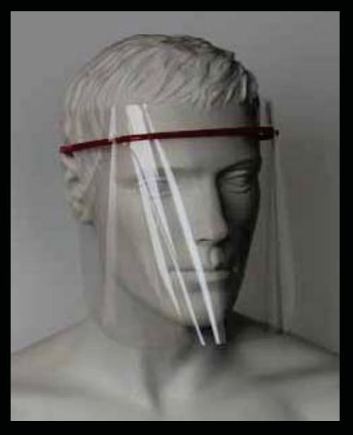
Frame Face Shield (Code: PPE-DFS)