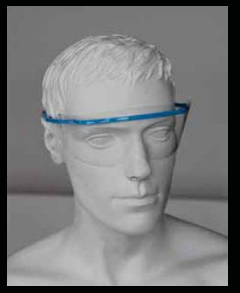
Disposable Glasses (Code: PPE-DG)